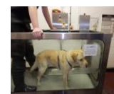
January 2014 – Toby Linklater